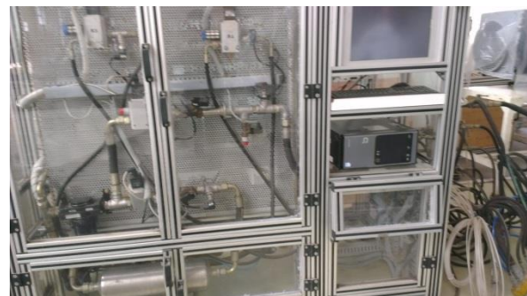
Figure 2 The DMRC Test Rig

However, there are still many parts on the DMRC Test Rig that needs to be improved and further developed for this to become complete. Figure 2 presents the DMRC Test Rig at Faiveley Transport. During the development some valves have been tested which showed a positive results.